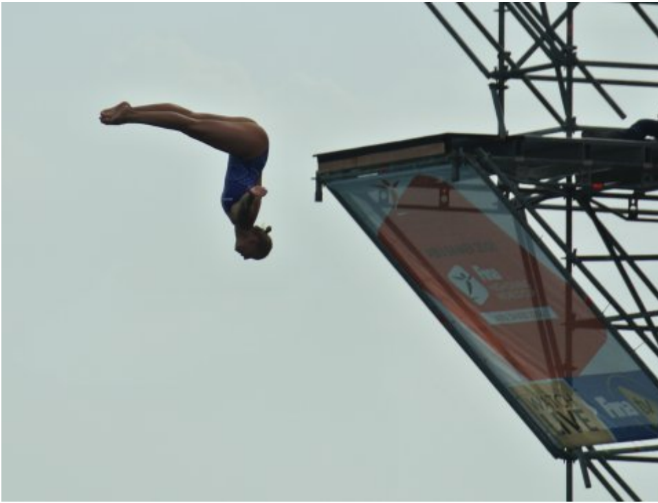
Rhiannan Iffland (AUS) in action

Asked if the absence of Jimenez somehow facilitated her task, the Australian great admitted: “There is always something I think while going to a competition: I cannot change what other divers are doing. I need to focus on my own dives and performances”. For 2019, the gold at the FINA World Championships in Gwangju (KOR) is a “real goal”. “I cannot say that I am the ‘athlete to beat’ at this stage. Each competition is different, is anyone’s game, really!”, Iffland concluded.