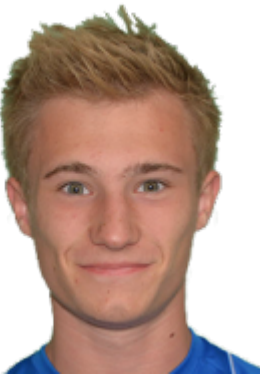
Jack LAUGHER Member