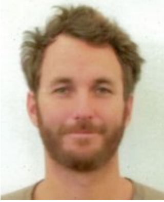
Aaron PEIRSOL Member