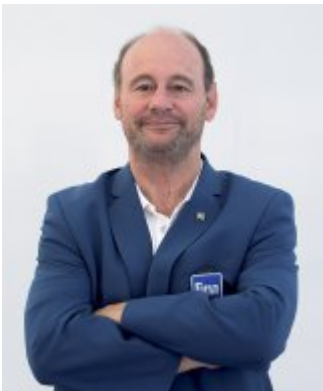
Noam ZWI Events Sub-Committee