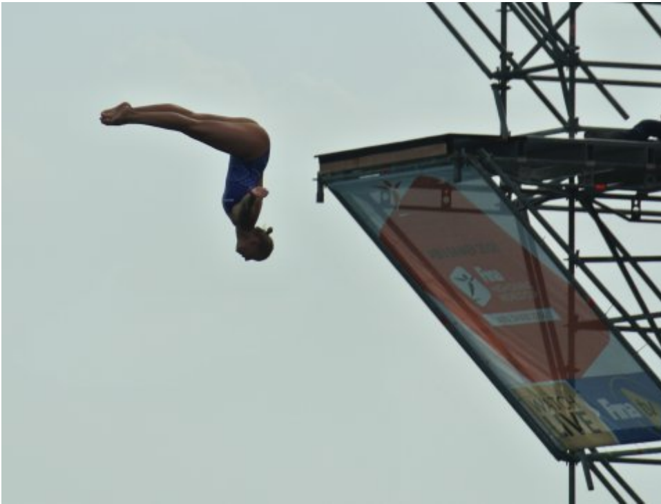
Rhiannan Iffland (AUS) in action

Asked if the absence of Jimenez somehow facilitated her task, the Australian great admitted: “There is always something I think while going to a competition: I cannot change what other divers are doing. I need to focus on my own dives and performances”. For 2019, the gold at the FINA World Championships in Gwangju (KOR) is a “real goal”. “I cannot say that I am the ‘athlete to beat’ at this stage. Each competition is different, is anyone’s game, really!”, Iffland concluded.