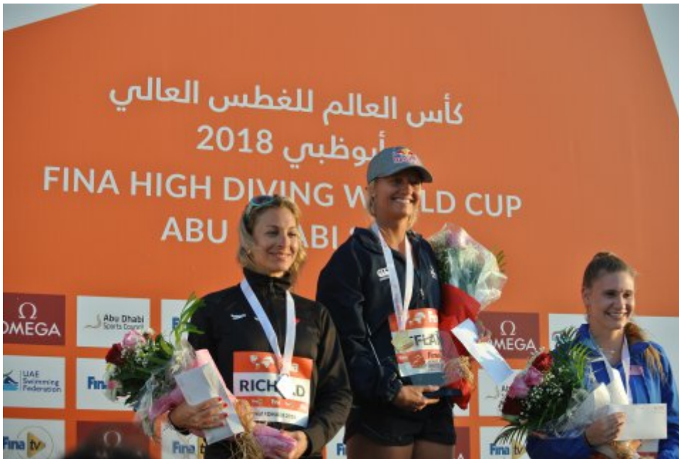
The women's podium

In the women's event, Rhiannan Iffland added the World Cup title to her 2017 world championship gold medal, finishing the competition in Abu Dhabi with 322.95 points. Her supremacy over the four rounds of dives was undisputed, and the lead after Day 1 was never challenged in the final two rounds.