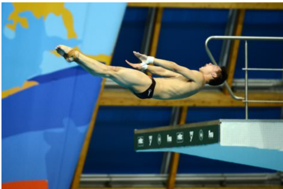
Men's 10m platform event in action

For the first time in Kazan one could see someone not representing China atop of the chart. The scores of the Round 1 of the men’s 10m platform reflected Thomas Daley of Great Britain 1.70 ahead of the victorious Aisen Chen. Posting 307C to open up the list, he awarded a high 98.60 mark with some perfect 10s for execution. Who knew, but it was a start of an outstanding show. Divers unveiled their thirst for excellence and shone bright with their skills. Another over 100 score came from Hao Yang, diving a Armstand back 3 somersaults pike on his 2nd attempt, which placed him among the pace-makers, ahead of Daley, on second. Aisen took the relay button on Round 4 to register 102.60 for Back 3.5 somersaults pike. The old good Daley did what he could, posting high scoring Forward 3.5 somersaults 1 twist pike and 626B, but it was not enough either to get or to push down the Chinese.