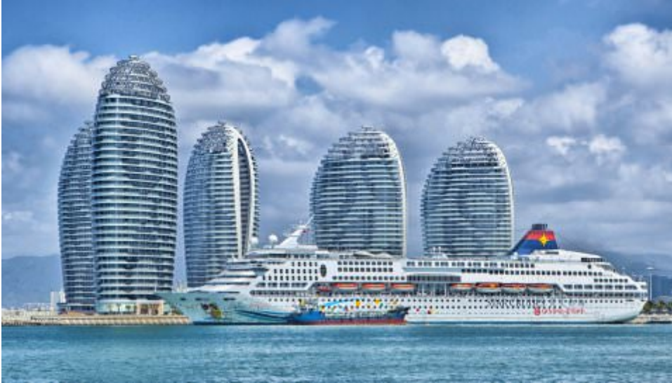
Sanya Phoenix Island International Cruise Marina

In recent years due to an increasing flow of tourism, Sanya City now has over one hundred luxury hotels, with an annual reception capacity over 10 million people. Sheraton, Hilton, Marriott, Ritz-Carlton and Yue Yong Zhuang are just some of the names of Intercontinental hotel chains that have settled in Sanya's tourist resort area. It has become the most important destination for golf and meetings in China.