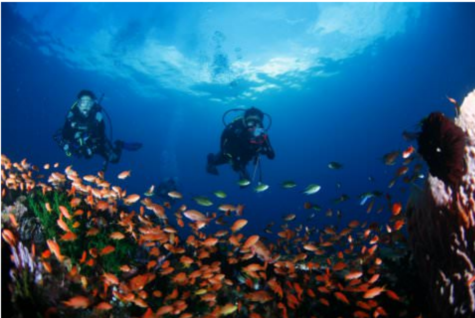
Diving in Sanya (CHN)

Sanya is China's only tropical city and has unforgettable charm. This rich, tropical paradise has a unique ethnic culture, a mild climate and has lush tropical scenery. These wonderful natural features are just some of the precious gifts that Sanya must offer. In this beautiful and peaceful resort, you can dive into the clear blue ocean and play in the waves, swim amongst the coral reefs and the vibrantly colored fish.