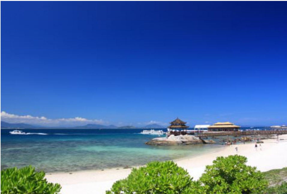
Clear sky in Sanya (CHN)